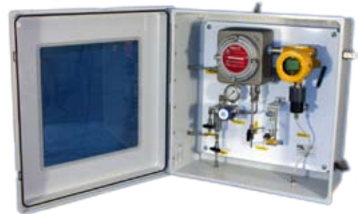
GDS-68XP in NEMA 4X Enclosure

The GDS-68XP contains a microprocessor controlled sequencer that manages the sample / purge cycle and maintains the sampled output during purge air operation. An integrated GASMAX CX gas monitor provides the sensor interface and signal conditioning, calibration, continuous