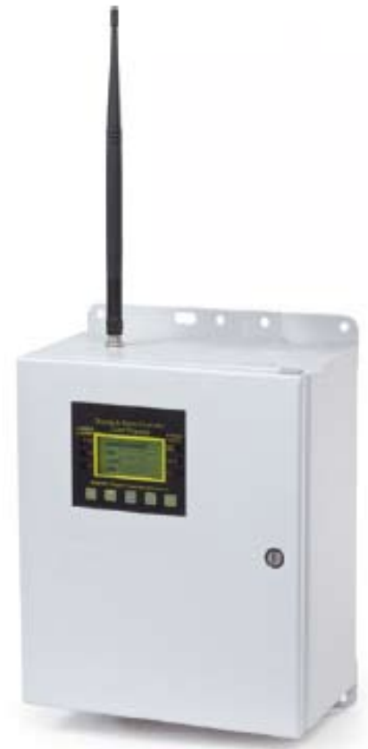
Available in NEMA 4X non-metallic, painted or stainless steel and NEMA 7 explosion proof wall mount

Unlike mesh networks and other systems designed for short range applications, the C2/TX utilizes Frequency-Hopping Spread Spectrum (FHSS) modems that offer higher power, longer range and lower susceptibility to interference. An optional multi-interface board supports an RS-232 or RS-485 wired serial port for remote MODBUS access, a solid-state data logger with USB interface, a second 900 MHz or 2.4 GHz radio for dedicated wireless remote access as well as an 802.11 WiFi interface for access via smartphones or tablets. WiFi-enabled C2/TX controllers also feature an integrated web server that allows users to remotely view real-time data, historical information and current configuration. With the correct password, remote users can change system setup variables. Finally, an optional satellite / cellular modem enables remote access from anywhere in North America.