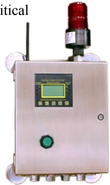
Available in NEMA 4X non-metallic, painted or stainless steel and NEMA 7 explosion proof wall mount

A large graphic LCD screen displays input data as calibrated engineering units, bar-graphs or 30-minute trends. Three adjustable alarm levels per channel, combined with programmable relays with voting logic allows flexible control of beacons, horns and other warning devices. Highly visible red and yellow LEDs visually indicate alarm status at all times. An internal real-time clock and event log maintain a record of calibration and alarm events.