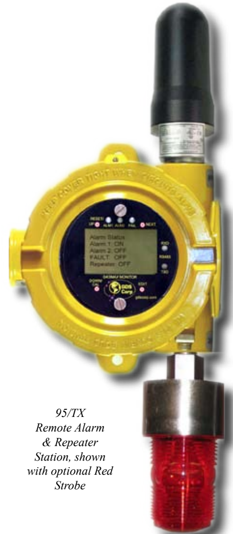
95/TX Remote Alarm & Repeater Station, shown with optional Red Strobe

Although most systems require the more sophisticated alarming and monitoring