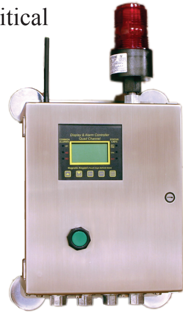
Available in NEMA 4X non-metallic, painted or stainless steel and NEMA 7 explosion proof wall mount

A large graphic LCD screen displays input data as calibrated engineering units, bar-graphs or 30-minute trends. Three adjustable alarm levels per channel, combined with programmable relays with voting logic allows flexible control of beacons, horns and other warning devices. Highly visible red and yellow LEDs visually indicate alarm status at all times. An internal real-time clock and event log maintain a record of calibration and alarm events.