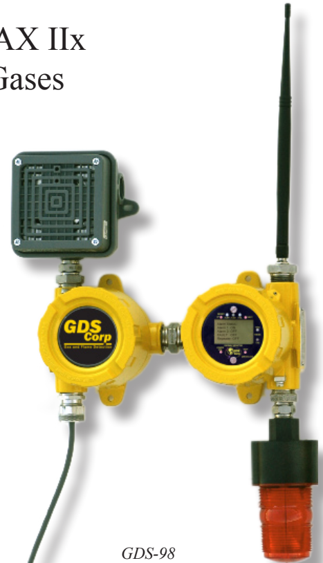
GDS-98 Wireless System Manager, shown with optional Red Strobe and Weatherproof Horn

In addition to system management and warning functionality, the GDS-98 can be programmed to retransmit wireless messages to additional GDS-95 Alarm Stations or GDS Corp Protector series Display & Alarm Controllers. Transmit power is adjustable from 10mW to 1.0