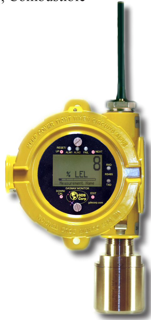
Shown with local stainless steel sensor head and 900Mhz whip antenna

An internal 900Mhz or 2.4Ghz license-free spread-spectrum wireless modem allows the GASMAX IIx to transmit gas detection data to a remote host controller. Every 6 seconds, the GASMAX IIx